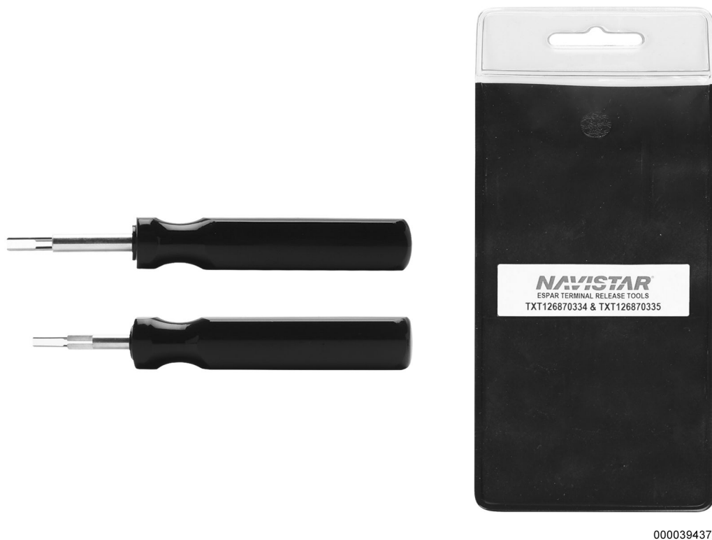
Figure 1. TXT126870334-5 – ESPAR Terminal Release Tools