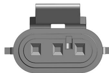
Figure 1. 12-171-02 Breakout Harness