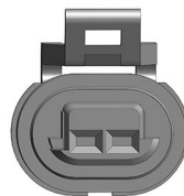
Figure 1. 12-166-01 Breakout Harness