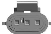
Figure 1. 12-169-02 Breakout Harness